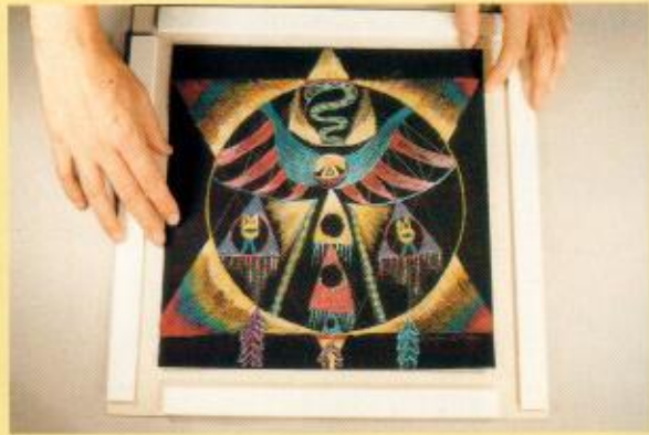
ELEVATION MOUNTING: POSITION ART. Dampen the mounting tape and position the artwork in the center of the mat blank, pressing it down on the mounting tape to secure it.