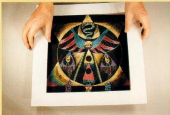
ELEVATION MOUNTING: MAT. Using a second piece of matboard, cut a beveled window and place it over the artwork. The window mat will rest on top of the spacers and will not contact the artwork.

VERONICA SEBASTIAN POTTER Mandala/Spirit Catcher