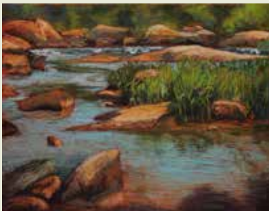
Pony Pasture Rapids