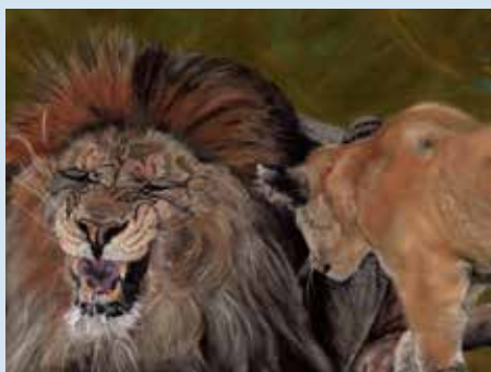
Fathers Day by Libby Mills