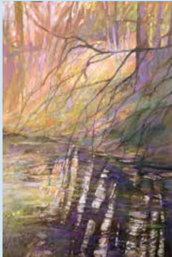
Autumn Reflections by Dale Sawan

Here are just a few of the featured paintings in the exhibit.