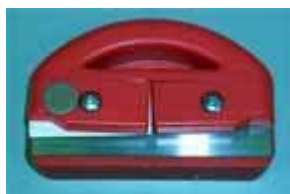
Dust Cover Trimmer