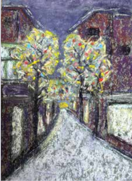
An Evening in Vermont