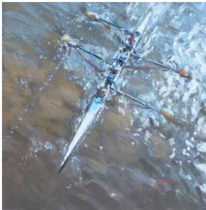
On The Yarra, AS Colourfix, Elephant

To read Regina's complete blog, click here .