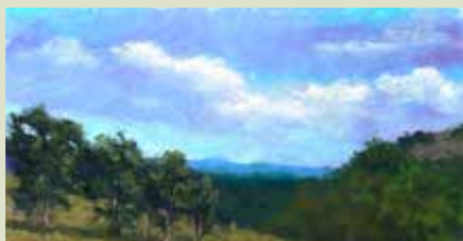
Highland County, VA