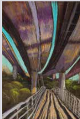
Belle Isle Bridge by Shavon Peacock