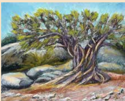
A Thousand Years