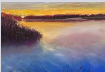
Sunrise at Big Ball Island