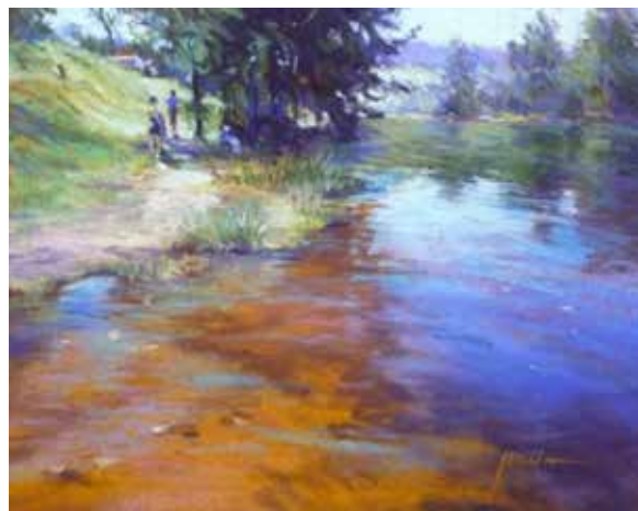
The Perfect Camping Spot , AS Colourfix, Raw Sienna