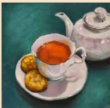
Tea for Me