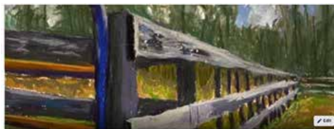
MAPS Members Make Art

MAPS' Social Media sites could use a member to oversee our Instagram, and our Private and Public Facebook pages. This is not a board position. We are looking for someone with some knowledge of posting on these sites, enthusiasm for attracting members to our Private page and to draw attention to our Public page. They would highlight societal events as well as post articles and links related to the medium of pastel. We hope to draw more attention to our Society.