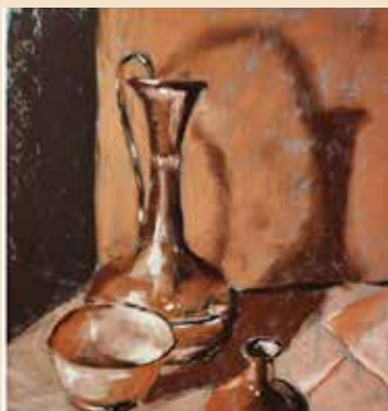
Metal and Clay

“The purpose of art is washing the dust of daily life off our souls.”