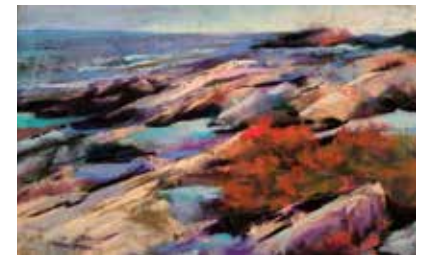
Rhode Island Coastline

The second image is the Rhode Island Coastline. Cynthia can't always get to some of these locations personally, but she can share the beauty through her art.