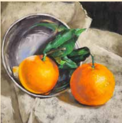
Mandarins and Pewter