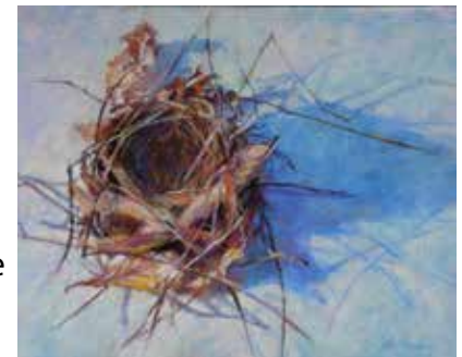
The Empty Nest

In September, her self-portrait Let there Be Light was juried into the Pastel Society of America Annual Exhibition, Enduring Brilliance . A little still life, Glass Bowl with Lemons was juried into the IAPS Annual Online Show, Open Division .