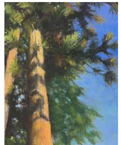
Things are Looking Up