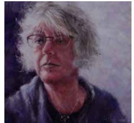
Let There Be Light