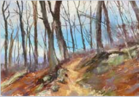
Winter Hike on the AT