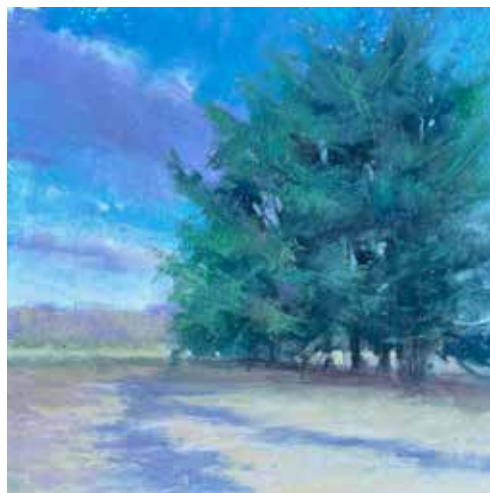
Beauty in the Cold