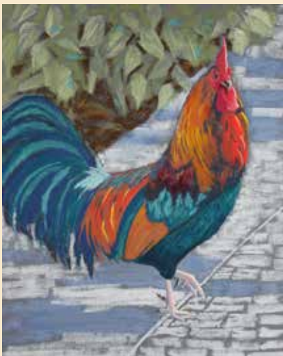
Cock of the Walk