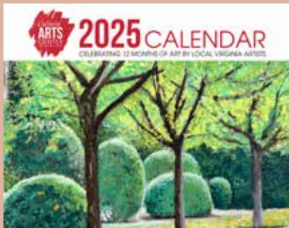
Cultural Arts Calendar 2025

The calendar is currently available for in the online shop at Cultural Art Center.