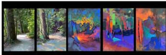
• From photo • to Local Color • to Looser • Abstract • to Minimalist