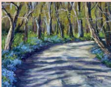
Country Road Blues