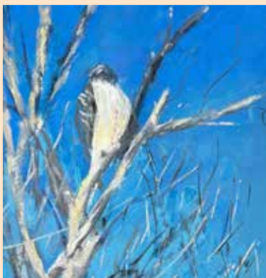
Surprise along the Hike