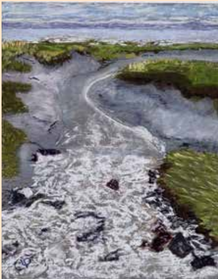
Mudflats at Fish Creek