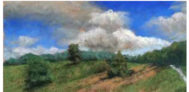
View from the Parkway

painting event in the northern neck. She will be traveling to Ireland in late July and in August to Blowing Rock, NC to paint plein air.