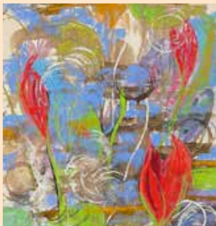
From Diana Sanford workshop