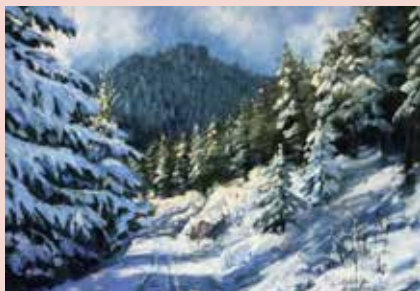
Winter Rhythem and Blues