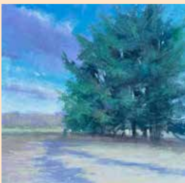
Peaceful Easy Feeling