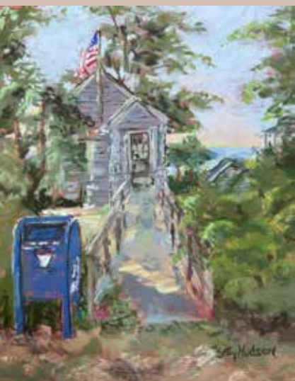
Letters from the Bay