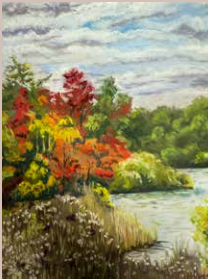
Autumn at Potato Creek