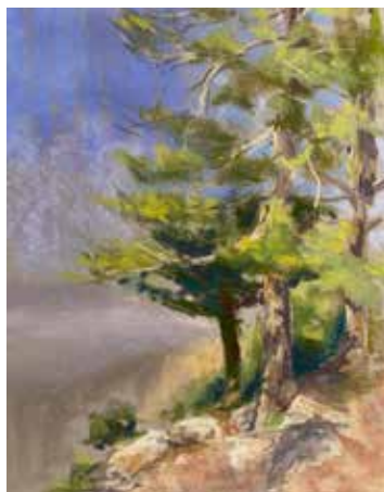
Trees, Rocks, Skies and Water