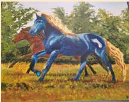
The Mark You Leave Matters