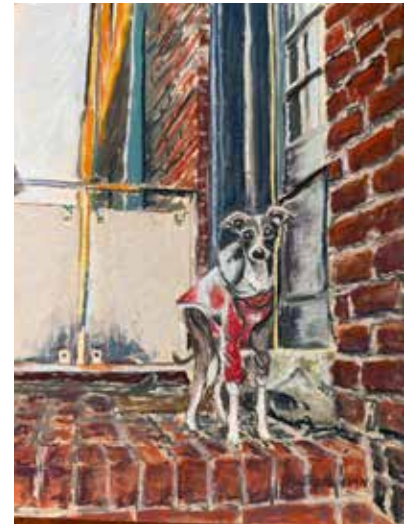
It's Cold Outside