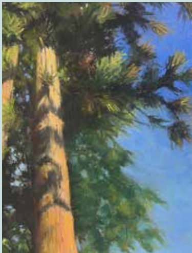
Things are Looking Up

In the same competition, she also received an Award of Merit for her painting, "Snow Day".