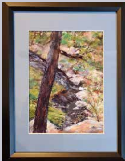
Recent Workshop Pastel