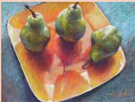
Green Pears Reflected

The AIS Small Works Showcase will take place at the Anderson Fine Art Gallery , St Simons, GA, April 25-May 28.