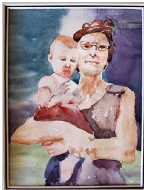
Watercolor of me and grandma

There is real joy in just seeing progress!