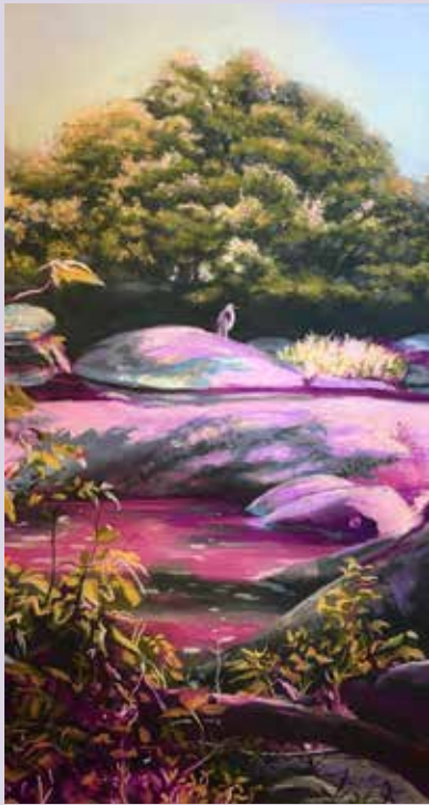
The Watchers, Part I