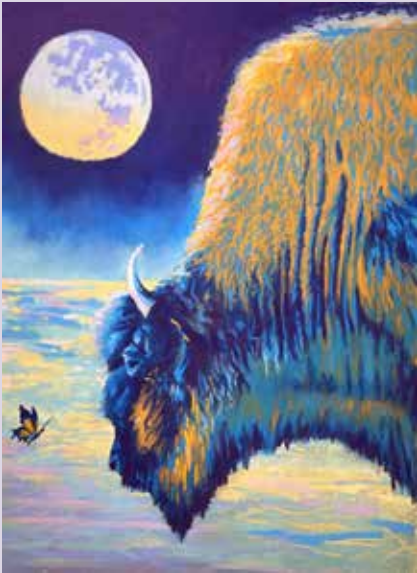
Emotional Buffalo II