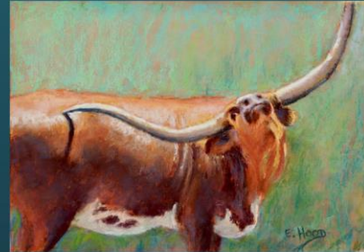
If it Itches by Elizabeth Hood

2016 Staples Mill Road, Richmond, VA 23230 804.278.8950 | www.crossroadsartcenter.com/collections/jral www.jamesriverartleague.com/jral-gallery-paintings