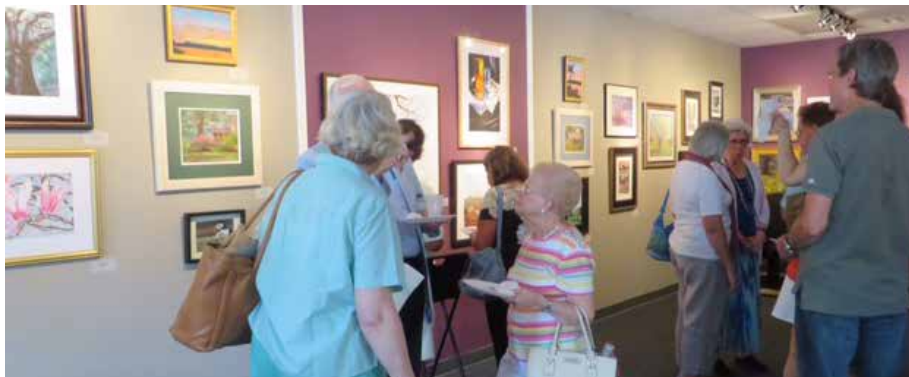
Exhibit at For Arts Sake