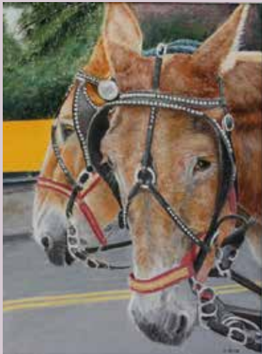
Would You Rather Be A Mule?