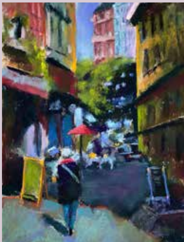
Afternoon in Lyon