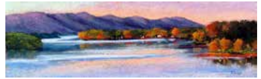
Break of Day

After retiring, I happened to see an ad in the Goochland weekly newspaper for a watercolor and pastel class