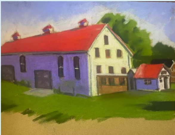
Day Two Reflected Light by Lynn O'Day