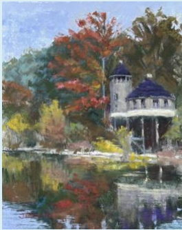
The Treehouse 12x9