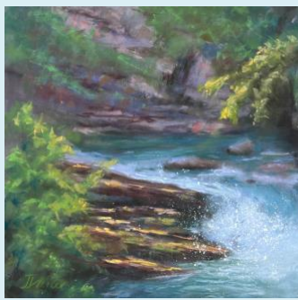
Quite the Splash! 9x9