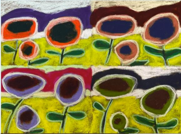
Day One Chroma vs Value by Sheila Chandler