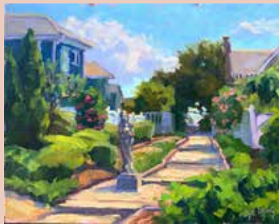
The Maiden Path , Oil