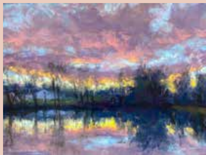
Evening Drama , Soft Pastel