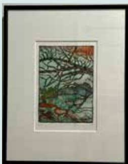
Atmospheric Study #4