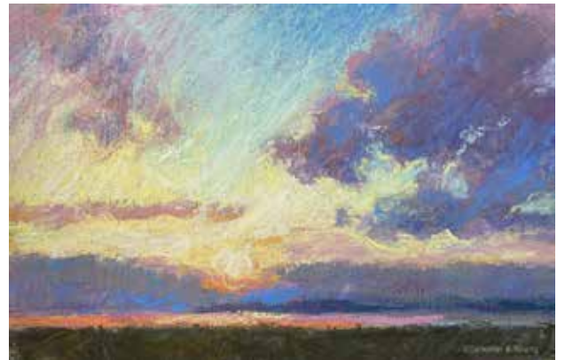
Chincoteague Sunset , Soft Pastel