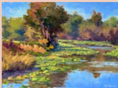
October by the Pond , Oil