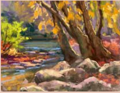
Autumn Morning by the Little River II , Soft Pastel