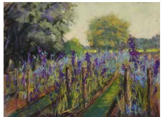
Larkspur Lane at Tuckahoe