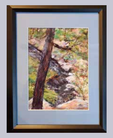
Recent Workshop Pastel