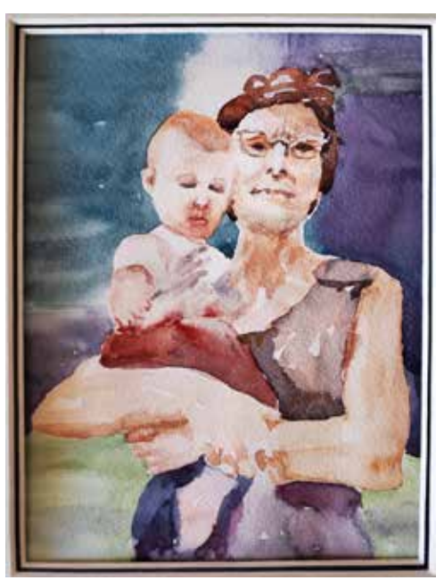
Watercolor of me and grandma

My husband and I have raised three sons. I retired from a career as a dental hygienist. I'm enjoying this next phase