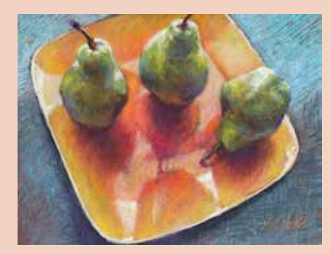
Green Pears Reflected

The AIS Small Works Showcase will take place at the Anderson Fine Art Gallery , St Simons, GA, April 25-May 28.